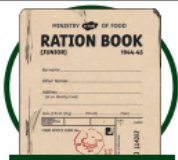
A ration book

Supply ships were targeted by German bombers and it was necessary to conserve as much food as possible. Rationing meant that each person was only allowed a fixed amount of foods. Ration books were issued, with coupons that showed people how much of each item they were allowed. Shopkeepers would remove or stamp the coupons when they were used. People were also encouraged to 'Dig for Victory' and grow as much of their own food as possible. Petrol, soap, clothing and timber were also in short supply. Clothing ration books were issued and people were encouraged to 'make do and mend'.